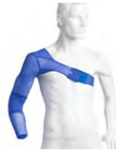
Stump Sleeve w shoulder attachment