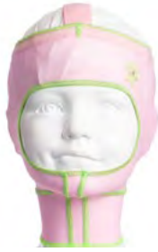
Open Head & Open Face