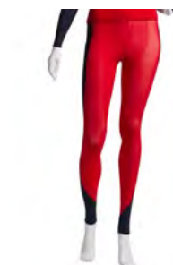
Waist-high 2 x leg