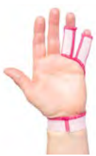
Finger Stall w wrist band