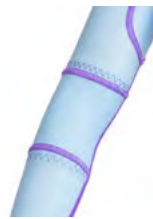
Anterior Elbow insert