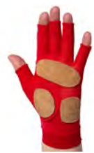
Palm Grip (suede)