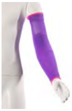
Armsleeve Wrist to Axilla