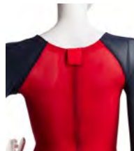
Zip Velcro® Tab