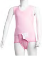
Body Brief (Snaplock)