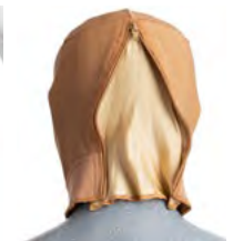
Hair Protective Covering