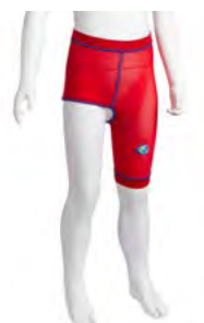
Waist-high 1 x leg