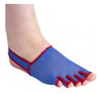
Slingback (for toe piece)