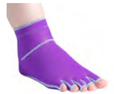
Individual Toe Anklet