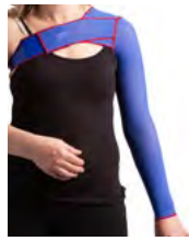
Armsleeve w shoulder attachment