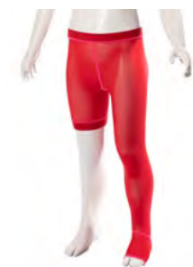
Waist-high 1 x leg w panty