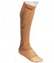
Zip Fastening Aids