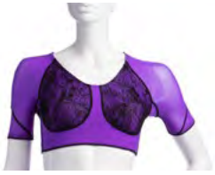
Bra Cups (+/- lace)