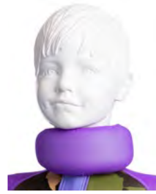
Chin Extension Collar