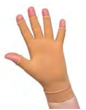
Thenar Eminence Free Thumb