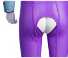
Child's Open Crotch