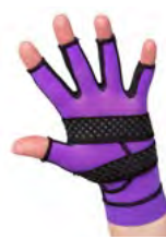
Palm Grip (silicone)