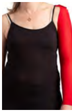
Armsleeve w bra-loop