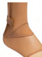
Anterior Ankle Insert