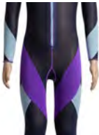
Postural Support (many variations)