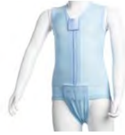
Body Brief (Velcro)