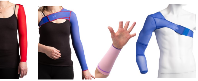
Armsleeve Wrist to axilla w bra-loop w shoulder