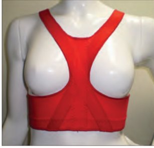
Sternal Strap - Front view