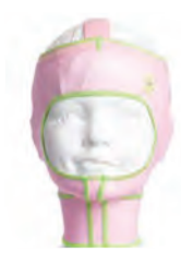
Open Head & Open Face