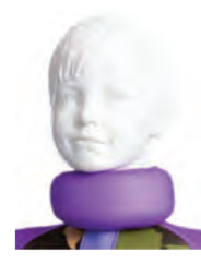
Chin Extension Collar