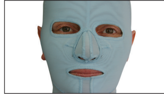
Ear pressure flap