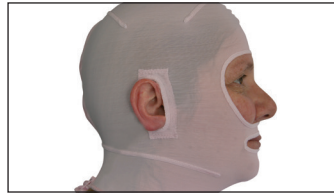
Chin extension collar