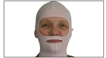
Zip - hair protective covering