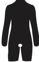
Body Suit With Sleeves - 0560 To distal measurement above knee