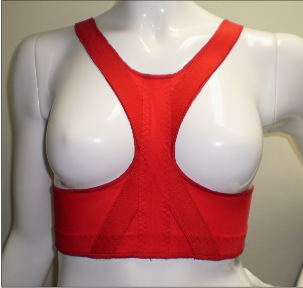
Sternal Strap - Front view