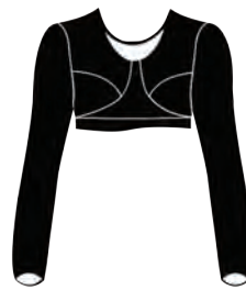
0564 LymphCrop Vest 2 Long Sleeves