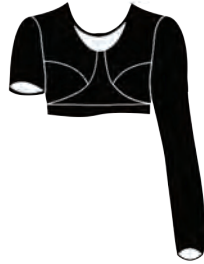
0563 LymphCrop Vest 1 Short Sleeves, 1 Long Sleeves