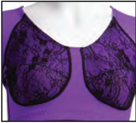
Contrast Bra Cup Lace